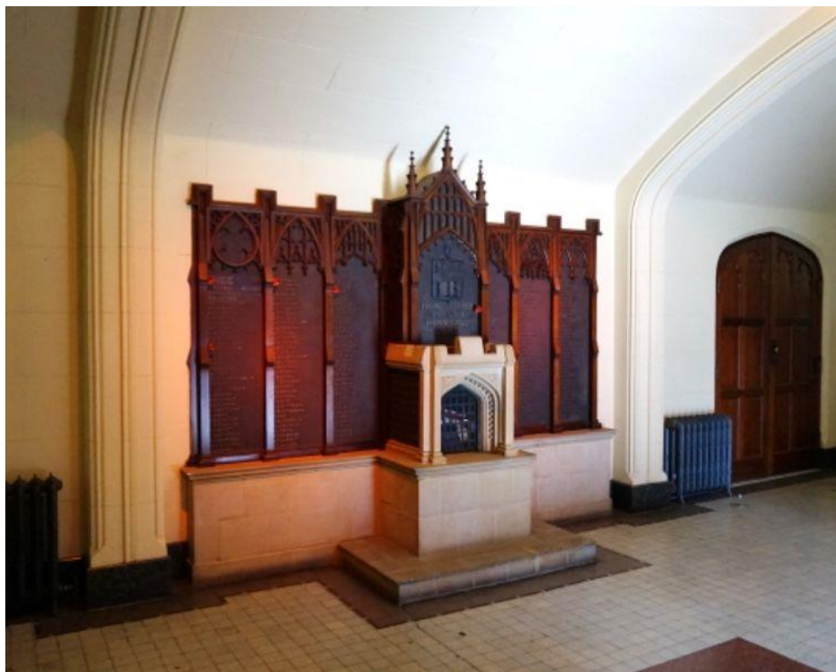
Melbourne Grammar School Honour Roll