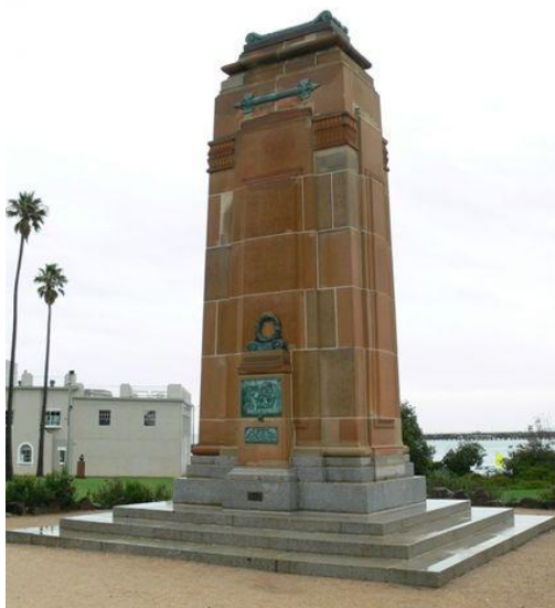
St. Kilda Cenotaph

The St. Kilda Cenotaph located at Catani Gardens, Fitzroy Street & Jacka Boulevard, St. Kilda does not list individual names.